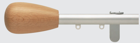
▲ 23mm Silver pole with beech paddle finial

The Mini-Metropole is the smaller diameter option of this range at 23mm. It is hand operated and available in white, chrome, silver, black, and gunmetal. The Mini-Metropole can be coordinated with a selection of delightful finials and midials in a range of designs and materials from beads to glass. For light to medium weight curtains. Can be bent to a radius of 150mm.