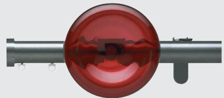
▲ 30mm Gunmetal pole with red discus