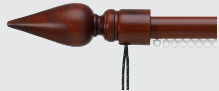
▲ 30mm Mahogany pole with wood spear finial