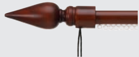
▲ 30mm Mahogany pole with wood spear finial