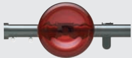
▲ 30mm Gunmetal pole with red discus